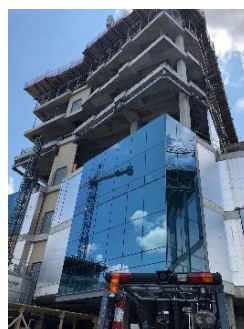
Installation of exterior